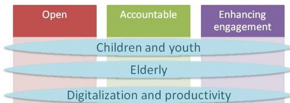
Picture 2 The main themes of Finland's second National Action Plan 2015 -2017

In Finland the Action Plan is implemented on all levels of the government: ministries, state agencies and municipalities. Goals have been created under the commitments, but once the implementation starts, the commitments will turn into individual actions and measurable targets in ministries, municipalities and regional councils. These goals can be further clarified during the implementation. The goal is to get open government enhancement to be part of each and every development project and programme. Ministries, agencies and municipalities are not asked to set up individual open