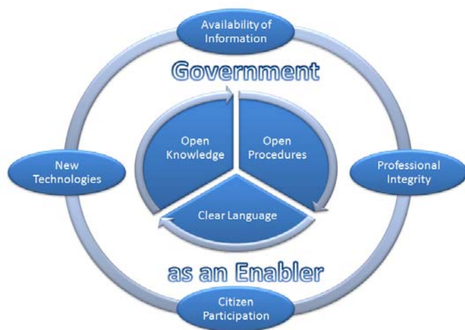
Picture 1 OGP principles (outer circle) and themes of the first Finnish action plan (inner circle).

The theme of Finland's first action plan is enhancing engagement. The action plan has been implemented in four areas that are 1) Open procedures 2) Clear language 3) Open knowledge 4) Government as an enabler.