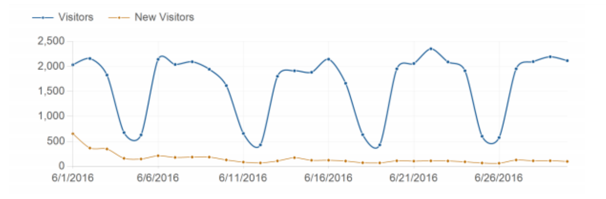
Graph 1: Example on usage of the geoportal during June 2016

During 2016 data from the project of Aerial photography of the Republic of Albania that is still ongoing, such as the 2015 ortho photo, has already been published in the Geoportal. Also different existing datasets like Land use, Cadaster, Geology and protected Areas are in process of updating.