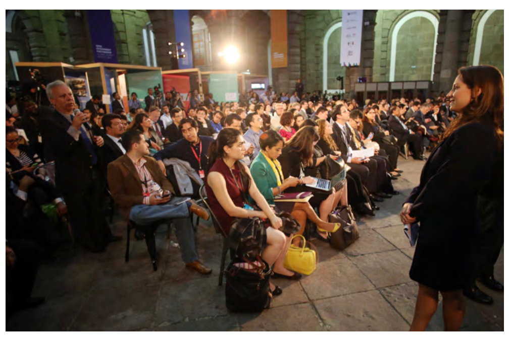
OGP 2015 Summit Mexico. Click here for the Summit in review.

Throughout 2015, the Support Unit and Independent Reporting Mechanism (IRM) staff