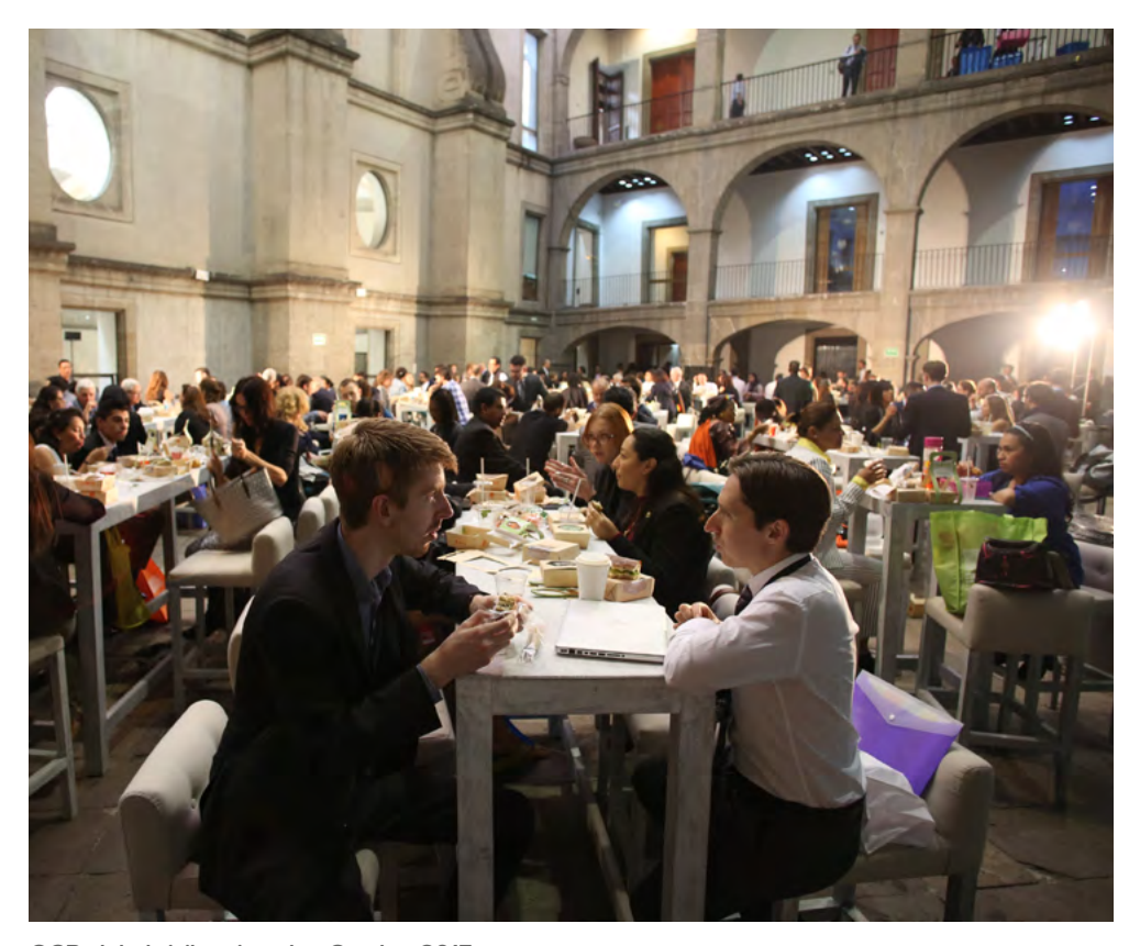
OGP global civil society day, October 2015.

The 2015 Civil Society Survey results indicate that progress is being made in incorporating civil society priorities in Action Plans. Of the over 600 survey respondents, 12% said that all of their priorities were included, 50% said a majority of priorities were included, and 32% that some of their priorities were included. In Liberia, the government went ahead with national consultations in all of the country's 15 counties