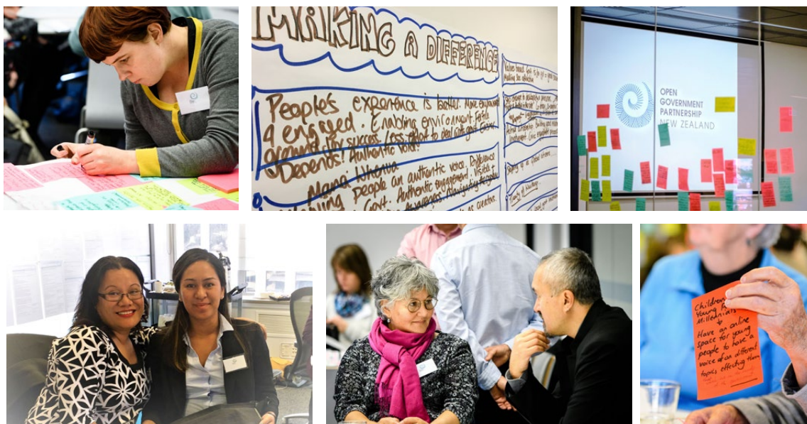
Our workshops were a great opportunity to gain new perspectives from many people.