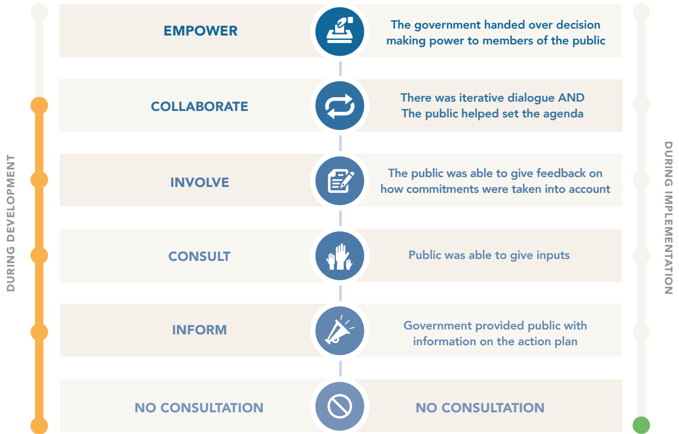
Table 2.2 | Level of public input

28-30 October 2014 with the theme “Sustaining open government, the role of government and civil society.” Despite multiple requests, GII did not provide the IRM researcher with meeting reports or an attendance list. Therefore, the IRM researcher was unable to ascertain who the meeting participants were or why the workshops were held so close to each other. According to the respondent at PSRS, one of the objectives of these two workshops was