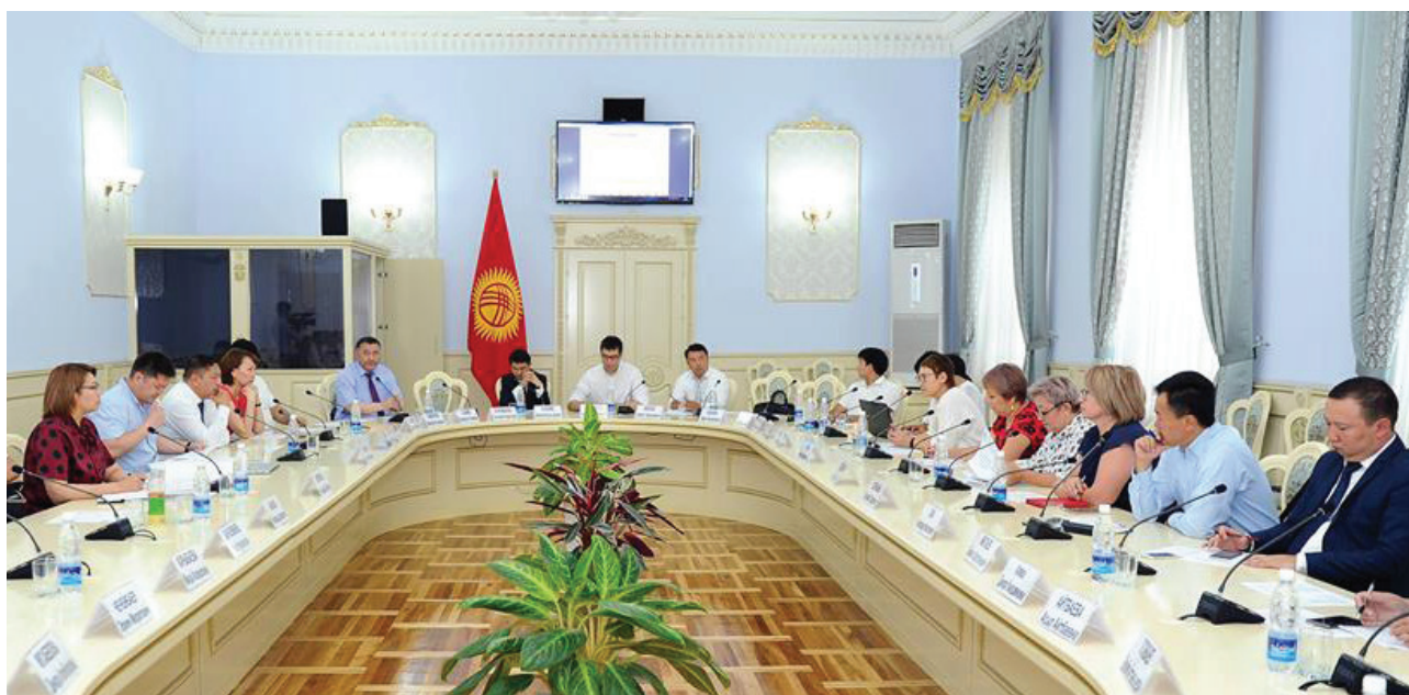
Photo 1. Third meeting of Open Government National Forum

Each commitment, after approval by the Open Government National Forum, was posted on the website www.ogp.el.kg and went through a public discussion procedure to collect opinions from the public. 22 public discussions were held and more than 219 members of the public, media and government agencies took part (Annex 1).